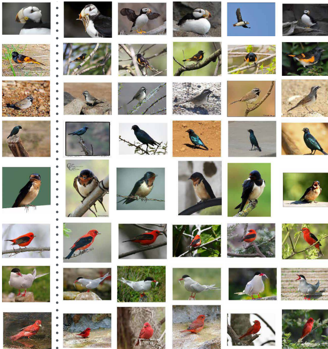
Figure 1: Examples of successful queries on the CUB200-2011 [3] dataset using our embedding. Images in the first column are query images and the rest are five nearest neighbors. Best viewed on a monitor zoomed in.

Due to the space constraints, we move additional visualizations to this supplementary material. Figure 1 shows some example query and nearest neighbors on the test split of CUB200-2011 [3] dataset. Figure 2 shows some example query and nearest neighbors on the test split of Cars196 [1] dataset. Figure 3 shows the t-SNE visualization of the learned embedding on our Online Products dataset in this supplementary material. The test split from our Online Products dataset has 60,502 images of 11,316 classes.